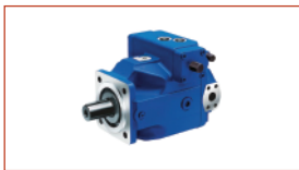
Axial Piston Pump