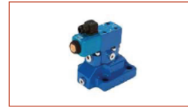
Pressure Control Valve