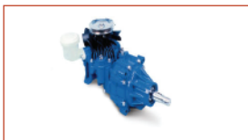
Radial Piston Pump