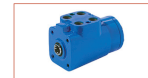
Hydraulic Steering unit