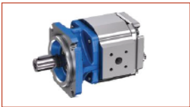
Int/Ext Gear Pump