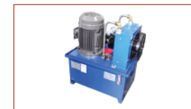
Hydraulic Power Pack