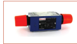
Flow Control Valve