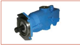
Axial Piston Motor