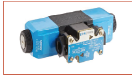
Directional Control Valve