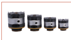
Hydraulic Cartridge Kit